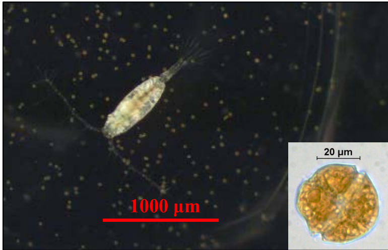
Figure 2: A photograph of a copepod (left) and the toxic alga Alexandrium sp. (right).

the laboratory. They raised all the copepods under the same conditions. The copepods reproduced and several generations were born in the lab (a copepod generation is only about a month). This experimental design eliminated differences in environmental influences (temperature, salinity, etc.) from where the populations were originally from.